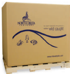
600 kg - IQF - Tote