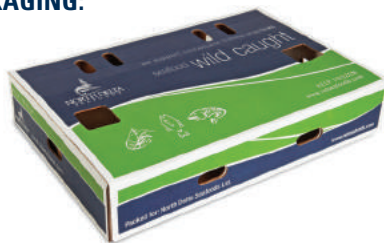
10 kg - Block/Shatter Pack