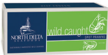
16 kg - IQF