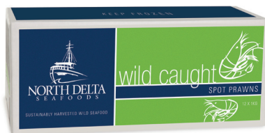
12 x 1 kg - Carton