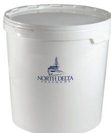
15 kg - Pail