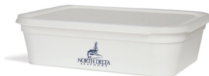
1 kg - Bento Box

PACKAGING: Green Roe 7 kg x 3 - 21 kg - Master Green Roe 10 kg x 1 - 10 kg - Master Caviar 12 kg x 1 - 12 kg - Master